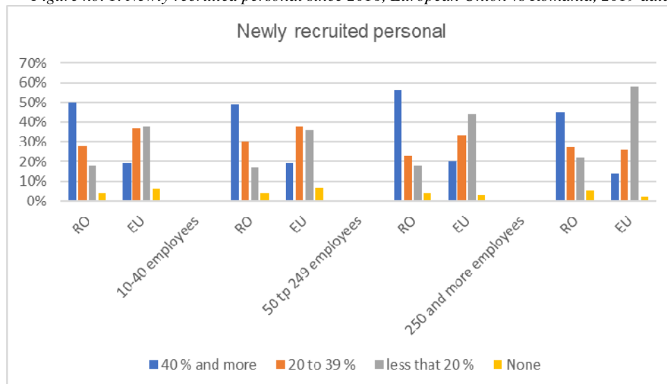
Figure no. 1. Newly recruited personal since 2016, European Union vs Romania, 2019 data